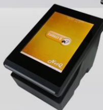
Touch Screen Dispenser