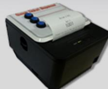
Thermal Ticket Dispenser